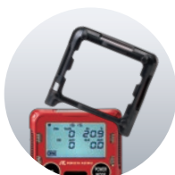
Protective cover (Part No. 4777 4161 10)