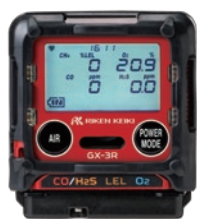
Appearance when attached